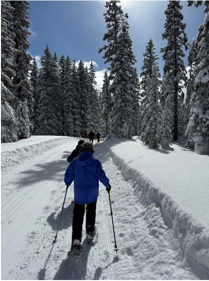
Snowshoeing Grand Mesa