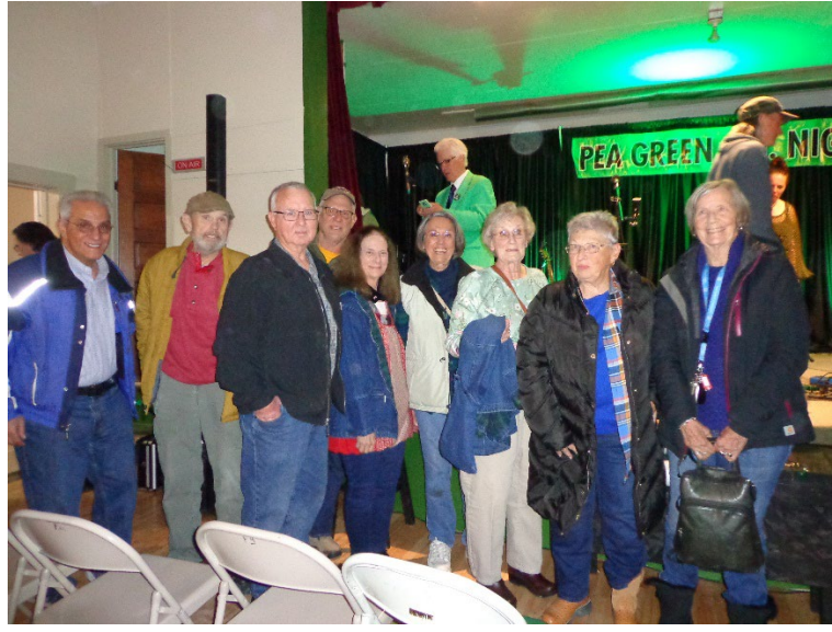
Pea Green Saturday Night