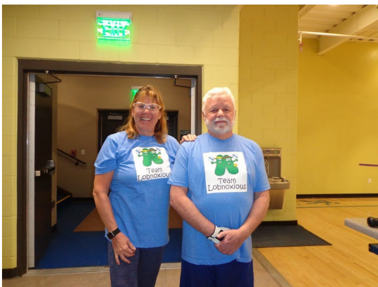
League Pickleball – Team Lobnoxious